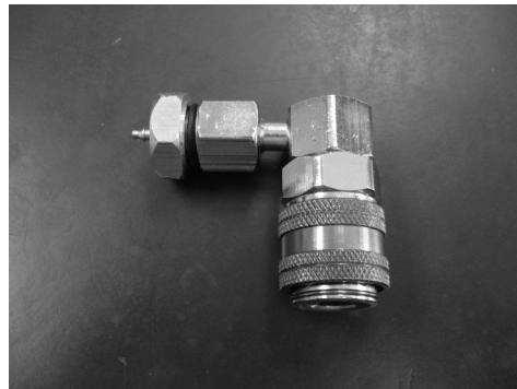
Coupler with Filter