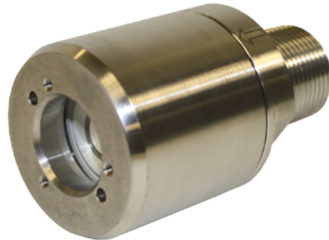
Figure 1: GDX-150 Ammonia Transmitter

Please review the GDA-400 manual (5700-9000) or the GDA-1600 manual (5700-9001) for a more detailed description of its 4-20 mA interface and for instructions on properly configuring the controller.